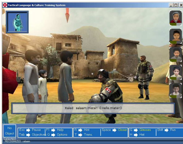
Figure 2. Example Mission Game dialog

In the Mission Game, the learner’s avatar must carry out a mission that involves interaction with the local people. In Figure 2, the player’s character (center, crouching) has just entered an Afghan village and initiated a conversation with a group of children. The boy in the foreground under the vertical arrow is the current focus of conversation; however, the other children nearby are also listening in and may jump into the conversation as appropriate. The face icons on the right margin are Rapport Meters, which indicate the current attitudes of the children toward the player.