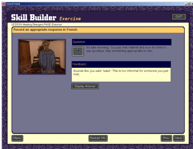
Figure 1. Example Skill Builder exercise

Games play an essential role in TLCTS courses, providing essential opportunities. Each course incorporates a scenario-based Mission Game, where learners play a character in a 3D virtual world that simulates the target culture. Figure 2 shows a screenshot from the Mission Game in the Canadian Forces version of Tactical Pashto.